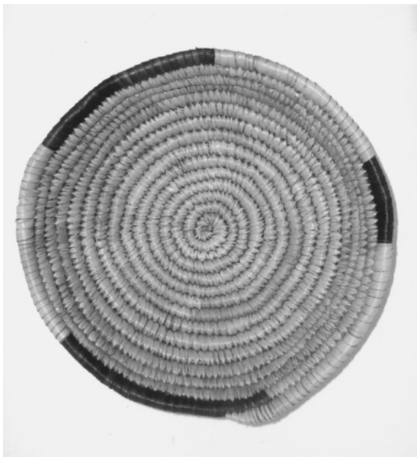
Basket making: A woven table mat.

purposes. Ikigega baskets provide storage facilities, but they also serve as barns or granaries where food materials are stored. Successful farmers often possessed several ikigega because they had a good harvest. Ikigega could be installed in the house or within the enclosure. Winnowing baskets ( intara ) are used for cleaning or drying sorghum, maize, beans, or cassava flour. Big winnowing baskets were used as carpets to dry sorghum or maize, and small winnowing baskets served as plates. 10