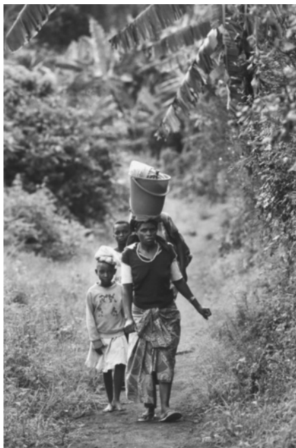
Rwandan woman walking with goods.

of bark for clothing diminished during the early part of the twentieth century and completely disappeared after World War II. 28