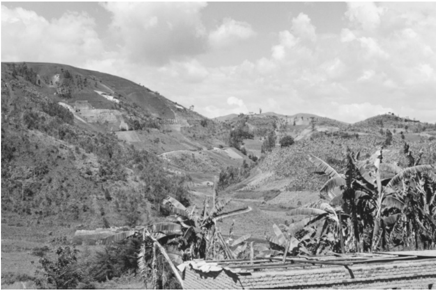
Banana trees growing in the hills and countryside of Rwanda.

Coffee is one of the cash crops produced in Rwanda. Although its success depends largely on world market prices, coffee production is contributing to the economic growth of Rwanda as well as helping improve the lives of its farmers. The government is using the cultivation of coffee as part of a practical economic and reconciliation program. According to a recent publication, "Coffee is being used in Rwanda to relaunch the economy as well as heal old wounds following the genocide. The Rwandan government is encouraging