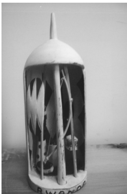
Rwandan wood carving showing household materials.

From ancient times to the contemporary period, examples of art include wood carving (such as images, doors, and musical instruments), house posts, drawings, masks, utensils, tools, and weapons. Rock paintings (drawings and paintings on cave walls), engraving on pottery, decorations, and inscriptions on baskets constitute an important part of art. One of the advantages of art is that it illuminates the understanding of African traditions. Artists were specialists who developed and transmitted the skill within the family from one generation to the next. Their works were predominantly traditional, and art objects were used in religious rituals, in initiation ceremonies, and for economic purposes. Some objects of African art reflect the socioeconomic status of an individual, a family, or a community. They also may be symbols of position and power, such as kings' crowns, headgear, and the staff of authority.