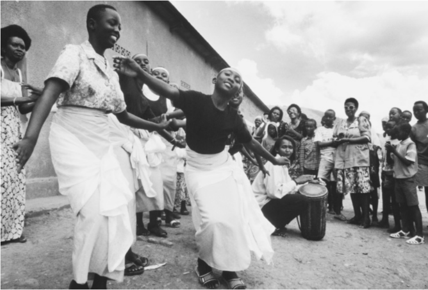
Rwandan children perform a traditional dance in traditional costumes.

Male and female dancers perform in separate groups and have their own form of dancing. Both men's and women's dances require physical fitness and mental alertness because they involve jumping, frequent body shaking, and sometimes violent movements. The movements beautifully synchronize to the beat and tempo of the drum or whatever instruments are being played. A strong interface and communication exist between the dancers and drummers and musicians.