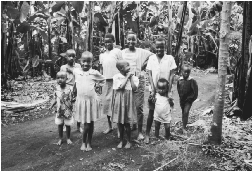
Tutsi children gathered together.

The socialization process begins during infancy with the family playing a major role. In traditional Hutu families, the mother had a direct and predominant interaction with the baby by nursing, washing, and watching over the infant during the day. Tutsi families were generally wealthy, however, which enabled them to hire maids to take care of the child as well as clean their homes. At night, babies slept in their parent's bed until the child was at least six months of age. The nursing, or breastfeeding, period usually lasted for the first year.