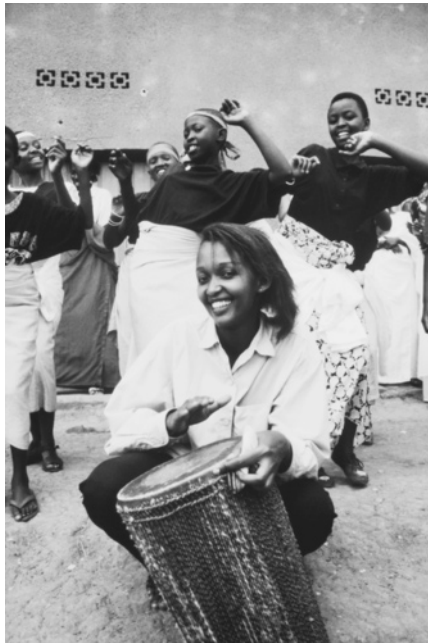
A Rwandan girl beats a drum as children perform a traditional dance.

Rwandan music is essentially a vocal genre, so not many instruments are played. Instruments include drums, inanga , ikembe , ingoma , and umuduri . Most of the instruments are made and played by men. As mentioned previously, drums were associated with royalty but were also used in social activities and ceremonies. Drums served the purpose of making public announcements or inviting people to public meetings. Drummers carried the message of the king to the people using the talking drum. During the colonial period, drums were used in schools to signal their opening and closing and to mark special occasions. 12