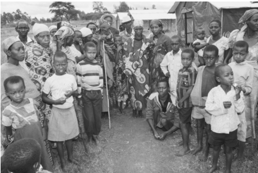
Women and children at Nyakaraui transit camp.

Aside from the Jewish Holocaust, other acts of genocide during the twentieth century include the massacre of Armenians by the Turks in 1915, the killing of approximately 2 million Cambodians by the Communist Khmer Rouge between 1975 and 1979, the killing of thousands of Indians in Guatemala by the national army (1981–1983), and the massacre of Bosnian Muslims by Serbian forces in 1991. Although there may be exceptions, it appears that genocide often occurs in a nondemocratic society.