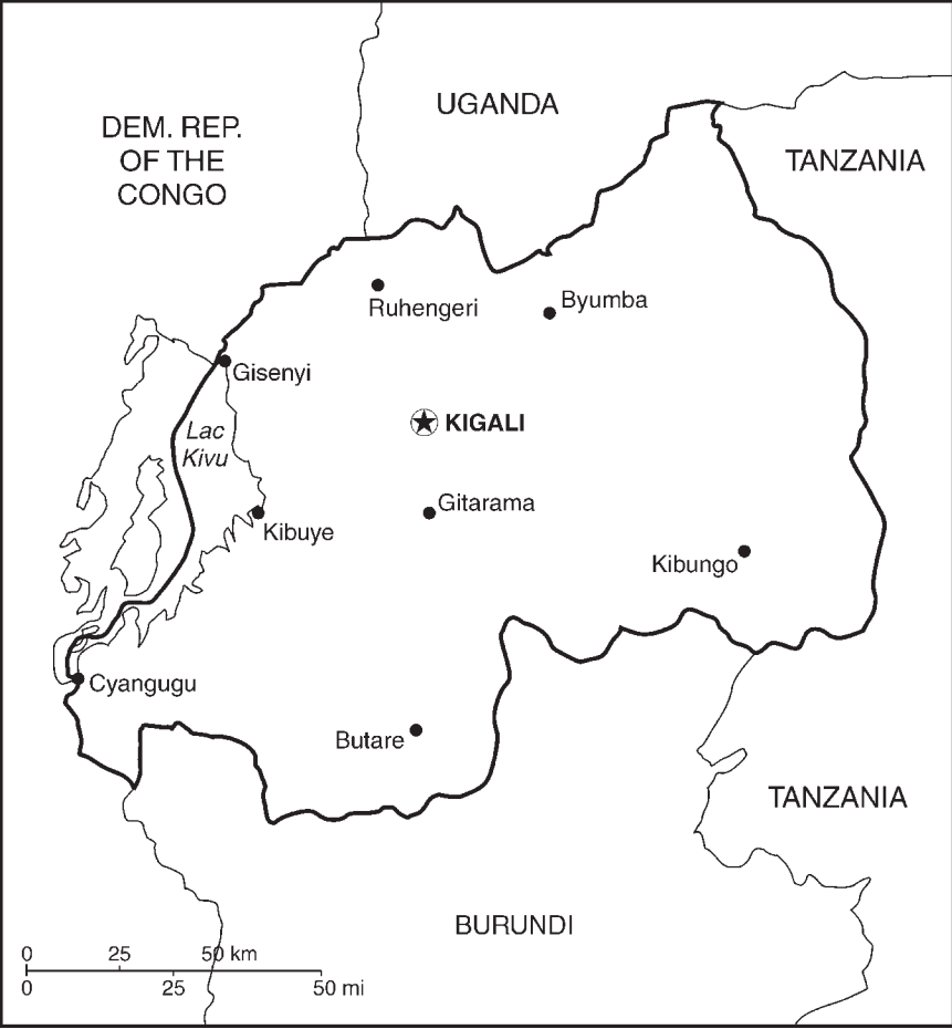
Map of Rwanda. Cartography by Bookcomp, Inc.