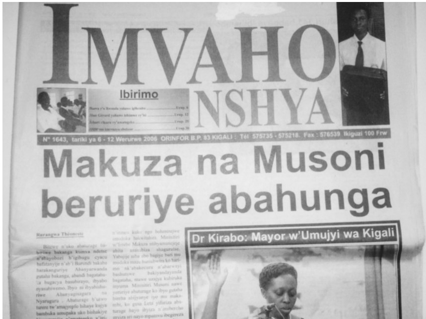
Imvaho Nshya , a Rwandan newspaper in Kinyarwanda.

affiliated with the Roman Catholic Church, Kinyamateka provided primarily religious news. It increased its circulation in 1955 and became a vehicle through which political ideas of the Hutu government were disseminated. Its readers were mostly members of the church. The bimonthly Dialogue , another independent paper founded in 1967 by the Roman Catholic Church, also enjoyed protection from the government. Although these two papers remained strongly associated with the government, their influence and power to criticize the government, especially on the treatment of the Tutsi, was significantly restrained in the postindependence period. Because of the political restructuring that was taking place, Kinyamateka ceased to be a mouthpiece of the government and became an independent paper in 1988.