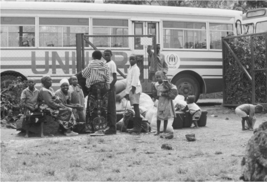
Tutsi refugees in transit in Rwanda.