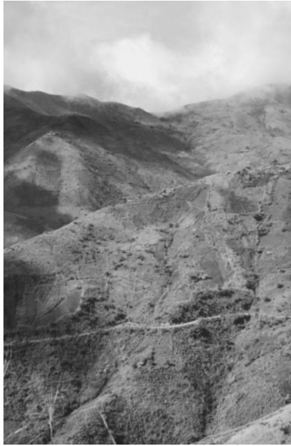
Rwanda agriculture and settlements in the hills.

Numerous lakes, rivers, and volcanoes exist in Rwanda. Among the lakes are Burera, Ihema, Kivu, Mugasera, Muhazi, and Ruhondo. Lake Kivu, which is the largest and the most spectacular, drains into Lake Tanganyika. The most important rivers include the Doma, Mulembwe, Ndahangwa, and Rusizi. The Virunga Range, the major volcanic highlands, is found to the north of Lake Kivu on the borders of Zaire, Rwanda, and Uganda. Adding to Rwanda's natural beauty are animals such as buffalo, elephants, gorillas, hippopotamuses, lions, and zebras. Several varieties of gazelle, snakes, and fish inhabit Rwanda.