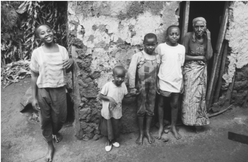
Elderly Rwandan woman standing with children outside of a mud hut.

Children undergo many types of training. For example, learning to greet and to respect elders is part of the early education. Training also includes how