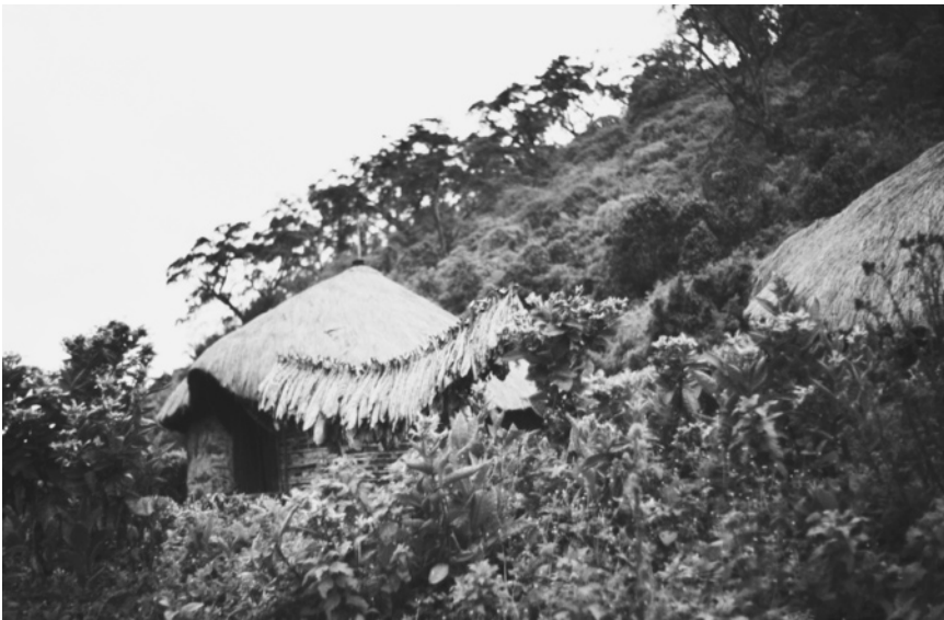
Rwandan hut with tobacco leaves drying outside.

Social events such as marriage ceremonies, entertainments, and relaxation activities were performed within the compounds. Archaeologists have unearthed remains of circular walls in Ryamurari, the old capital of the Ndorwa Kingdom, which suggests that the king's palace had an enclosure with cattle kraals built of cattle dung and garbage. Radiocarbon dates of the remains suggest that the walls were constructed between the eighteenth and twentieth centuries. 17 From the outside, the huts may look